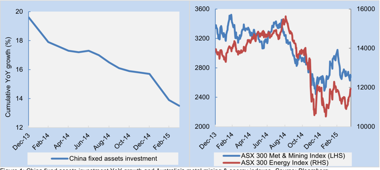
Figure 1: China fixed assets investment YoY growth and Australia's metal mining & energy indexes.

After enjoying more than a two-decade strong economic growth, China has aimed to switch from an investment-led economy to a consumption-led one, which has held back the country's fixed asset investment and weighed on its economic growth. In 2014, China's annual GDP growth went down to 7.4%, which is the slowest pace in the past two decades. According to <a href="MF">IMF</a>, things could get worse as it expects the growth rate to decline to 6.8% in 2015 and 6.3% in 2016. As Australia's biggest trading partner, China purchased nearly a third of the country's exports, most of which are metals, coal and natural gas. The investment and economic slowdown of China resulted in withering demand for resources, such as metals and energy, from Australia. The falling demand for metals and energy has caused the commodity prices to plummet and, in turn, has hurt Australia's metal and energy industry. Figure 1 illustrates that both the metal and energy index in Australia has dropped, while China fixed assets investment growth has slowed down since the end of 2013.