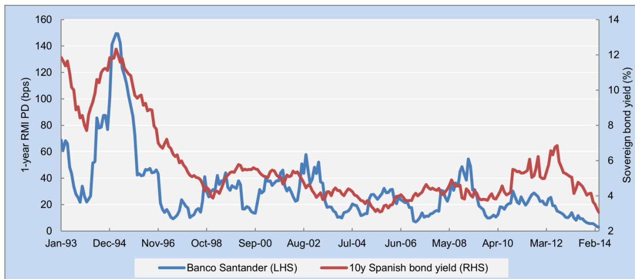
Figure 1: 1-year RMI probability of default for Banco Santander and the 10Y Spanish government bond yield.

Banco Santander may have benefited directly from the drop in Spanish sovereign yields. Santander held EUR 25.66bn of Spanish government bonds at the end of 2013, and was identified as one of the largest institutional holders of Spanish sovereign debt. The recent gain in government bond prices in 2014 may have contributed positively to the bank's Q1 assets as the instruments are classified as available for sale. In addition, dovish comments from the ECB could have also increased the values of the bank's other Euro nation's bond holdings, which amounted to EUR 12.08bn at the end of Q4.