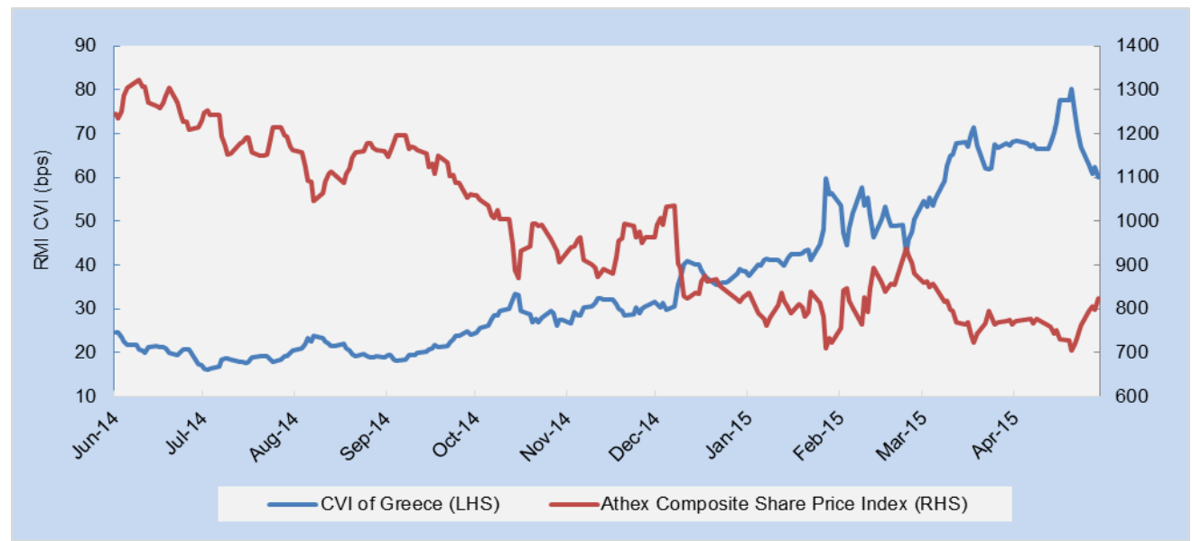
Figure 1: RMI value-weighted Corporate Vulnerability Index of Greece (LHS) and Athex Composite Share Price Index (RHS).

Figure 1 shows that the RMI value-weighted Corporate Vulnerability Index (CVI) of Greece, a value-weighted average of RMI 1-year Probability of Defaults (PD) of all listed firms in Greece, has an increasing trend from around 20bps in mid-2014 to 60bps on May 1, 2015. This can be interpreted as a deteriorating credit profile of the whole corporate sector in Greece. The recent drop in the CVI reflects the rebound in the Athens equity market, which has recently rallied because the market anticipates a deal between Greece and its creditors. On April 27, Greece's financial minister Yanis Varoufakis was sidelined after three months of fruitless talks with creditors to unlock EUR 7.2bn in bailout funds. On May 1, a top government official said Athens was willing to sell a majority stake in its two biggest ports and compromise on value-added tax rates and some pension reforms, which can be regarded as big concessions for the leftwing anti-austerity Syriza party. However, Greece has yet to reach a new aid deal with its lenders and fears of a default have swirled as government debt repayment deadlines approach.